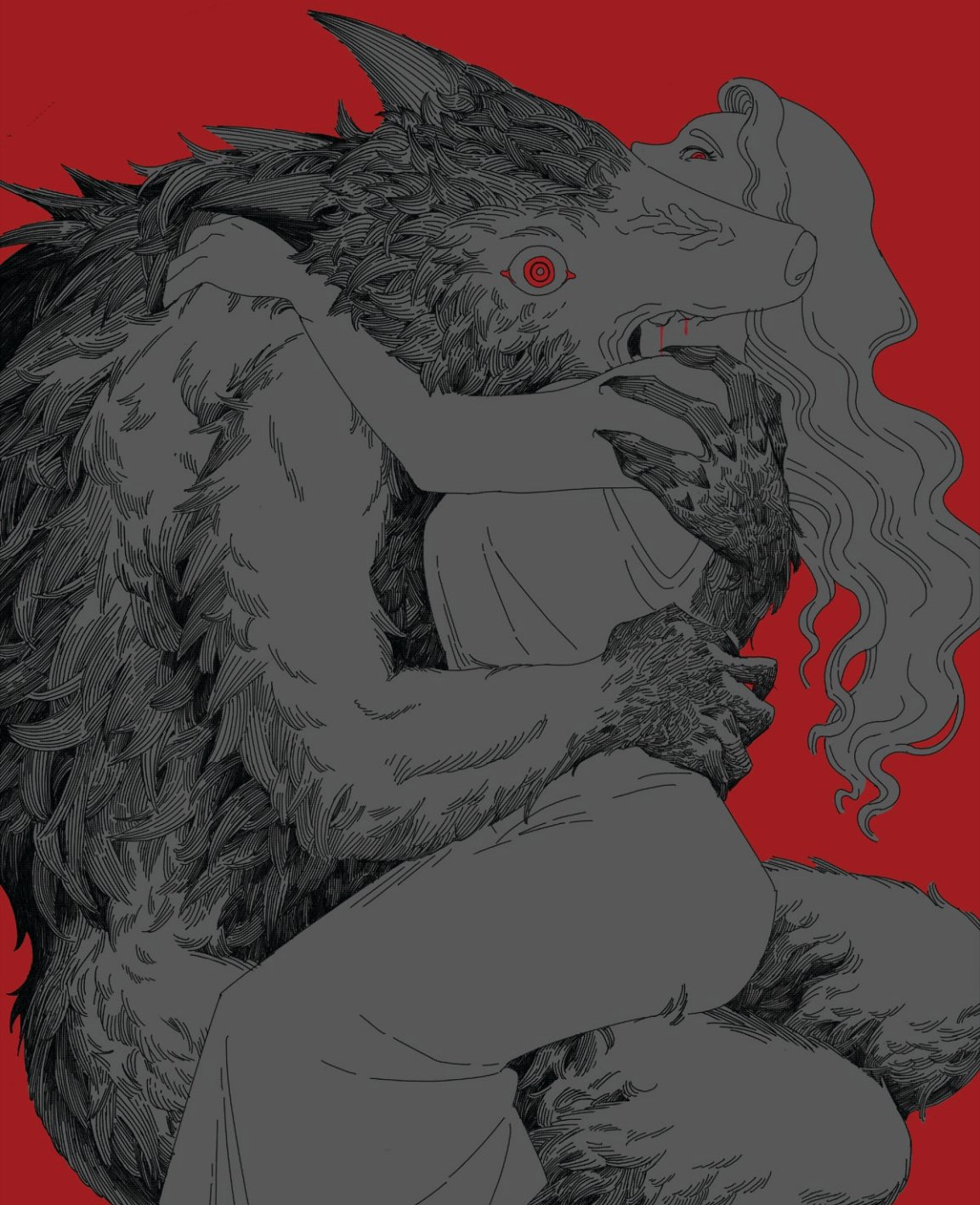
Meatgrinder I, 2019 9" x 12"