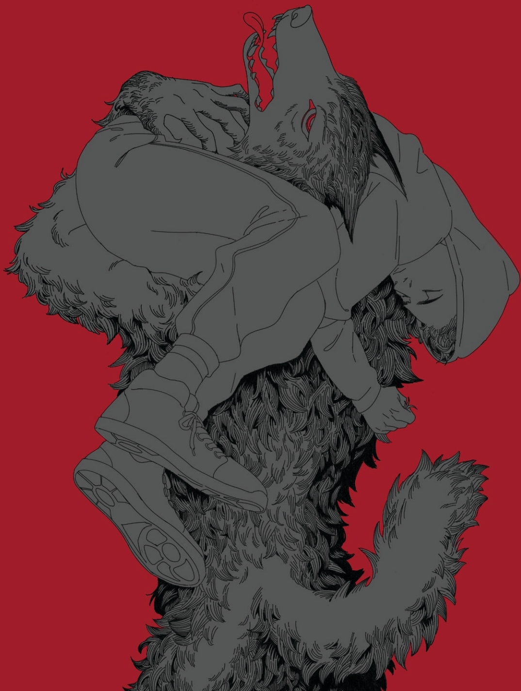
Meatgrinder II, 2019 9" x 12"