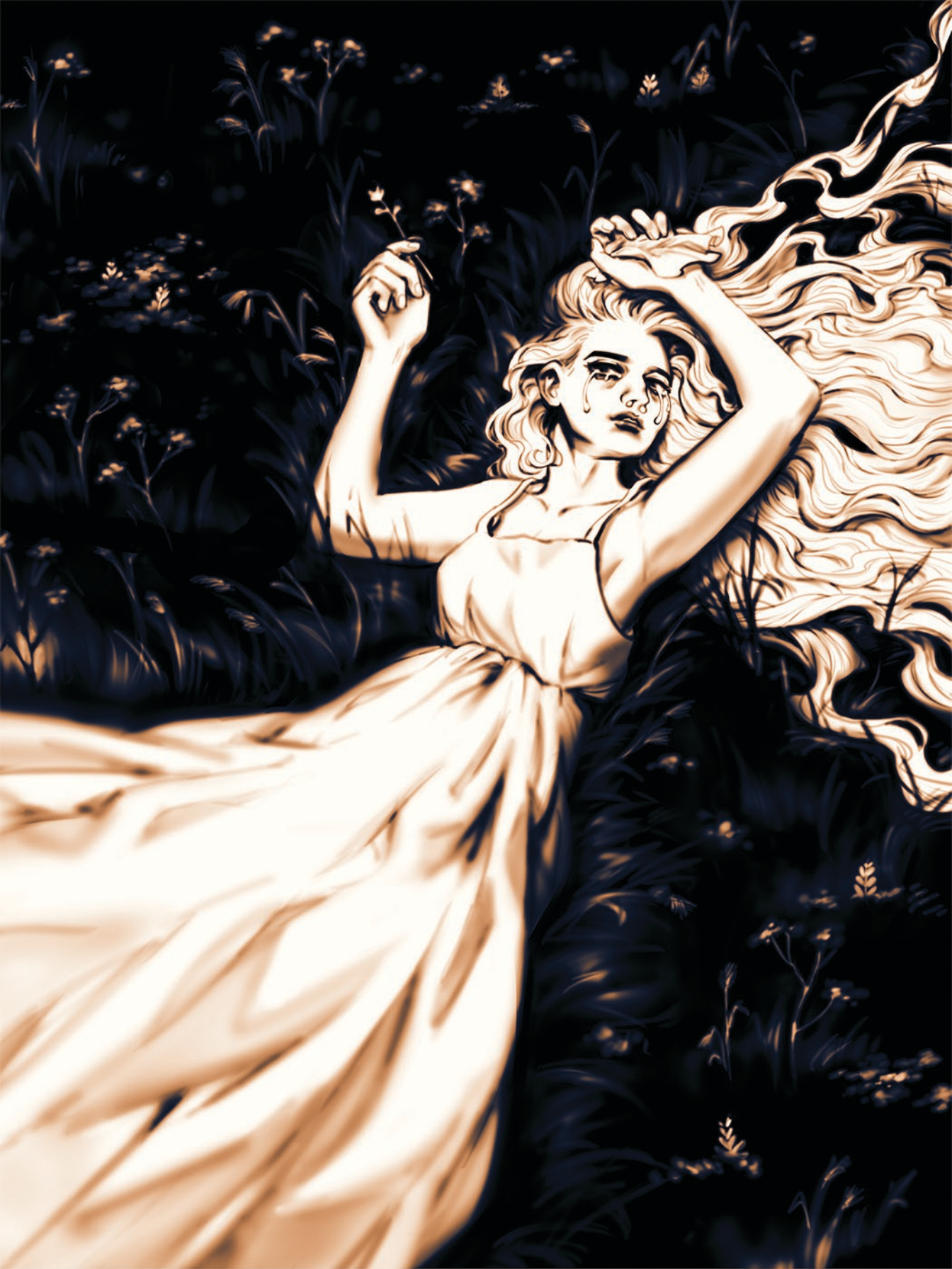
Hour of Emergence, 2020 9" x 12"