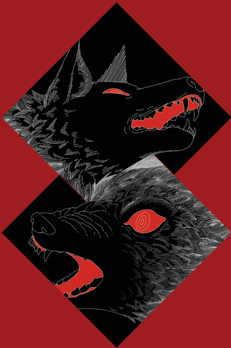
Twin, 2019 9" x 12"