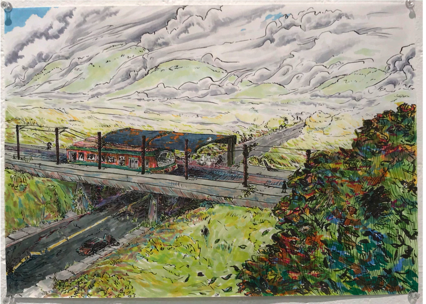
Train Stop, marker, 2021