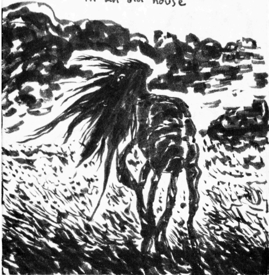
page from CAA zine, pen, 2020

✓ YES remember we do not understand the world. There are other ors. It is bigger than us and we need to stay safe. It is not safe to tread heavily in an old house