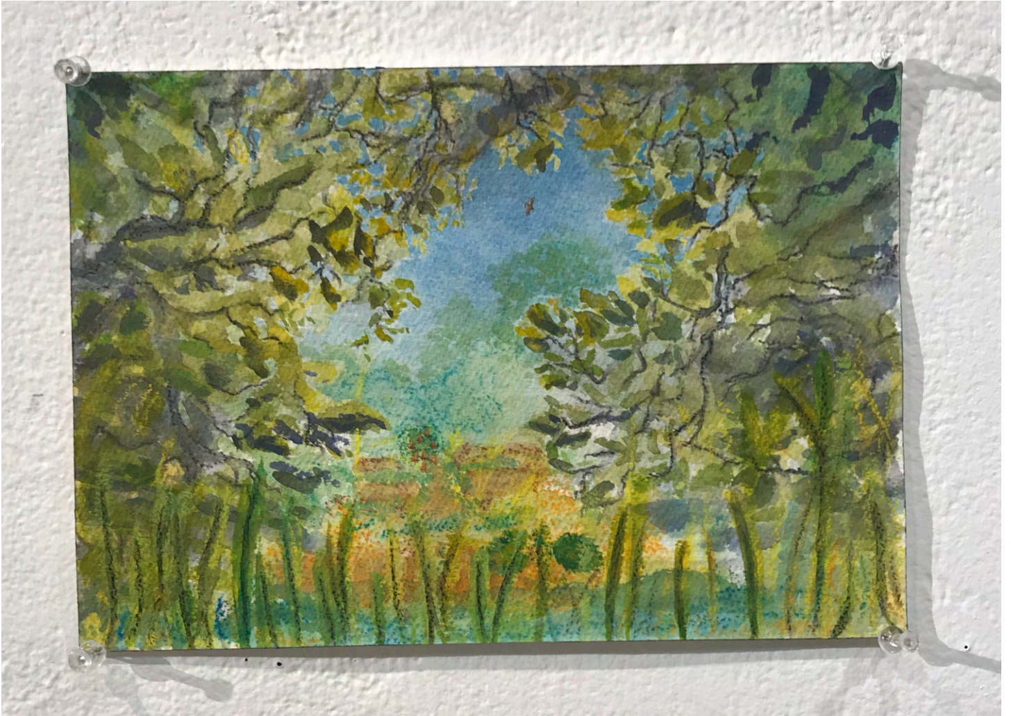
Red Shouldered Hawk, watercolor and gouache, 2020/21