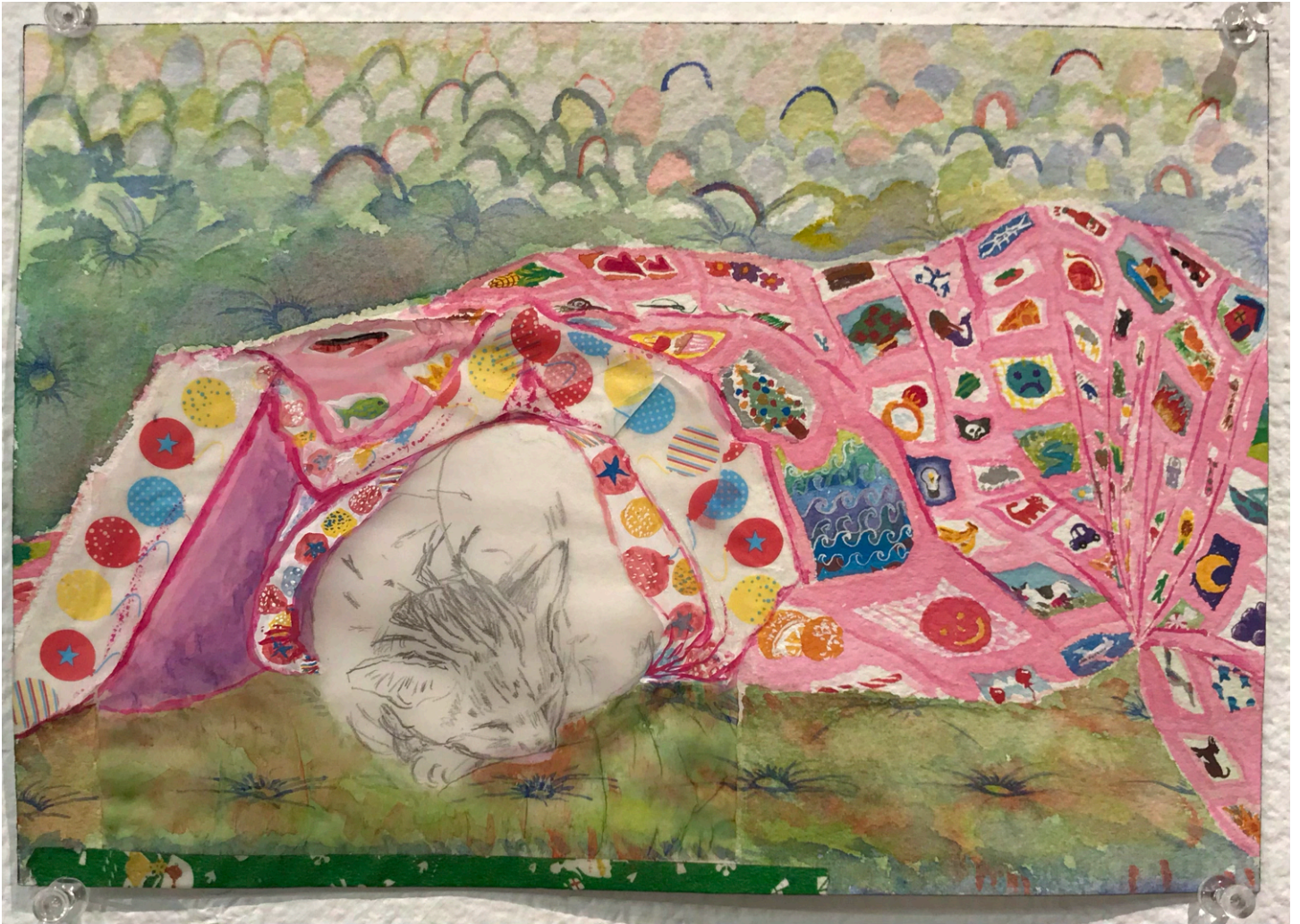
Dorothy, gouache, watercolor, tracing paper, 2021