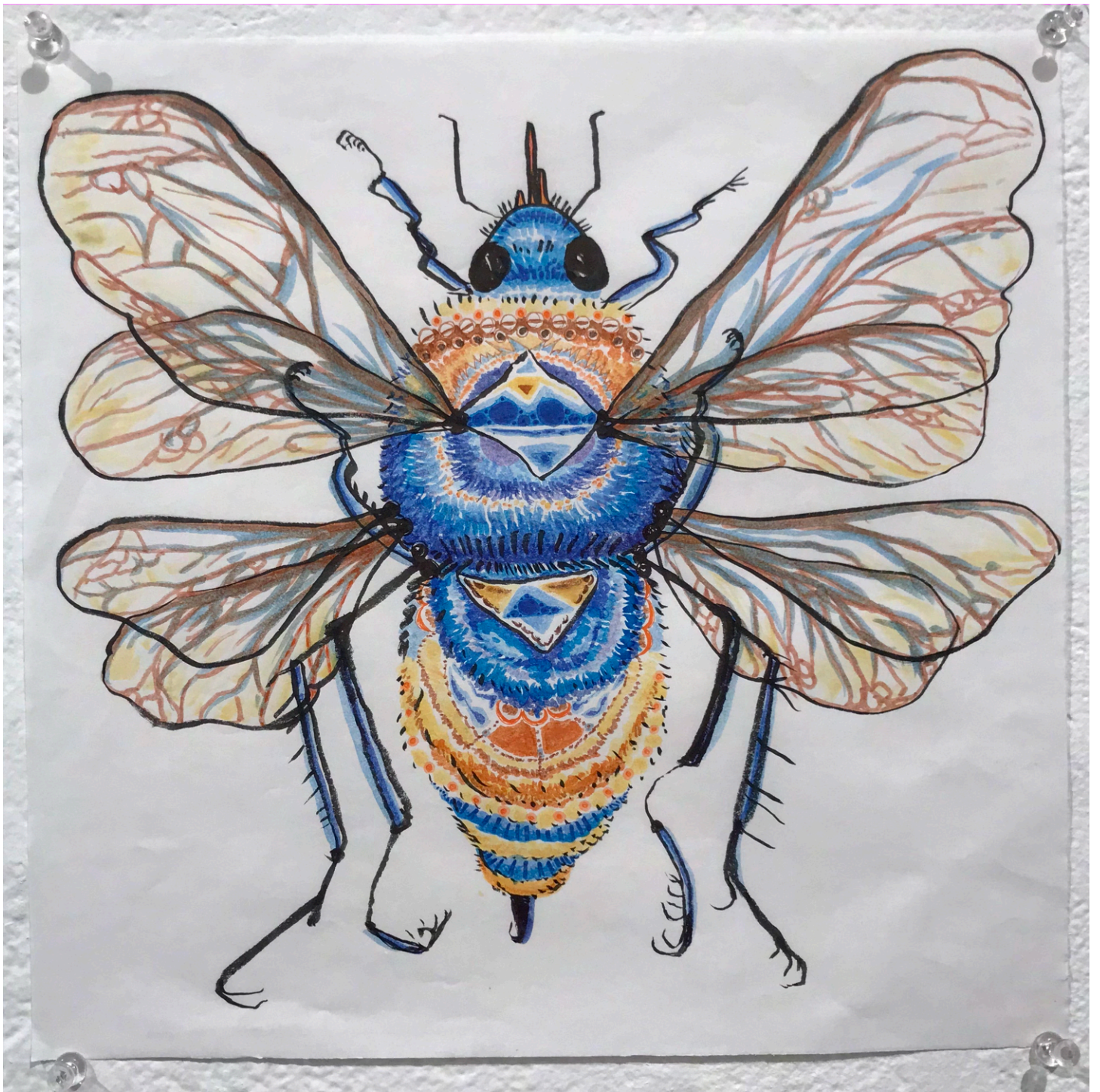
Bombus californicus , marker, 2020