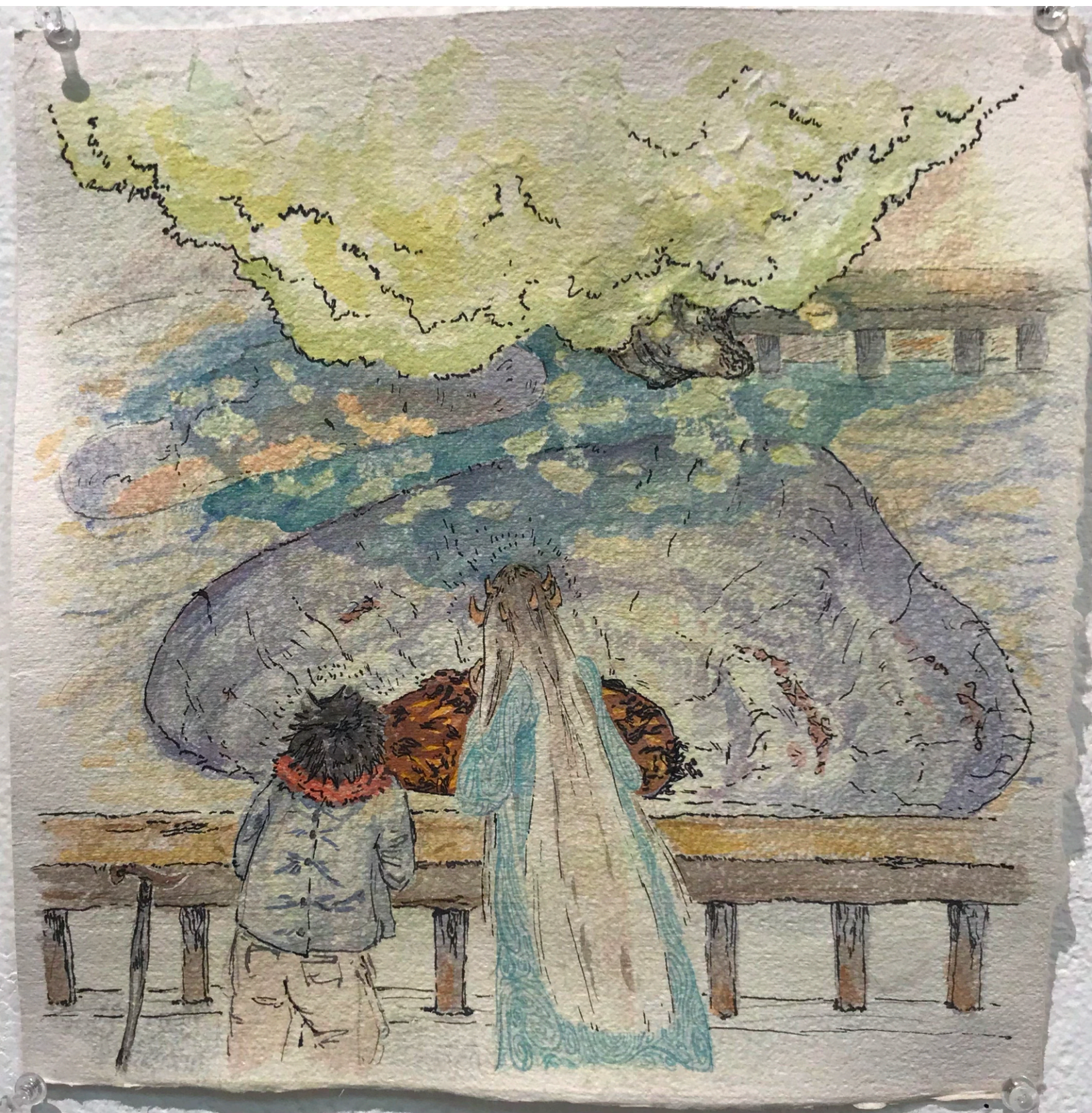
garden pond, watercolor, 2021