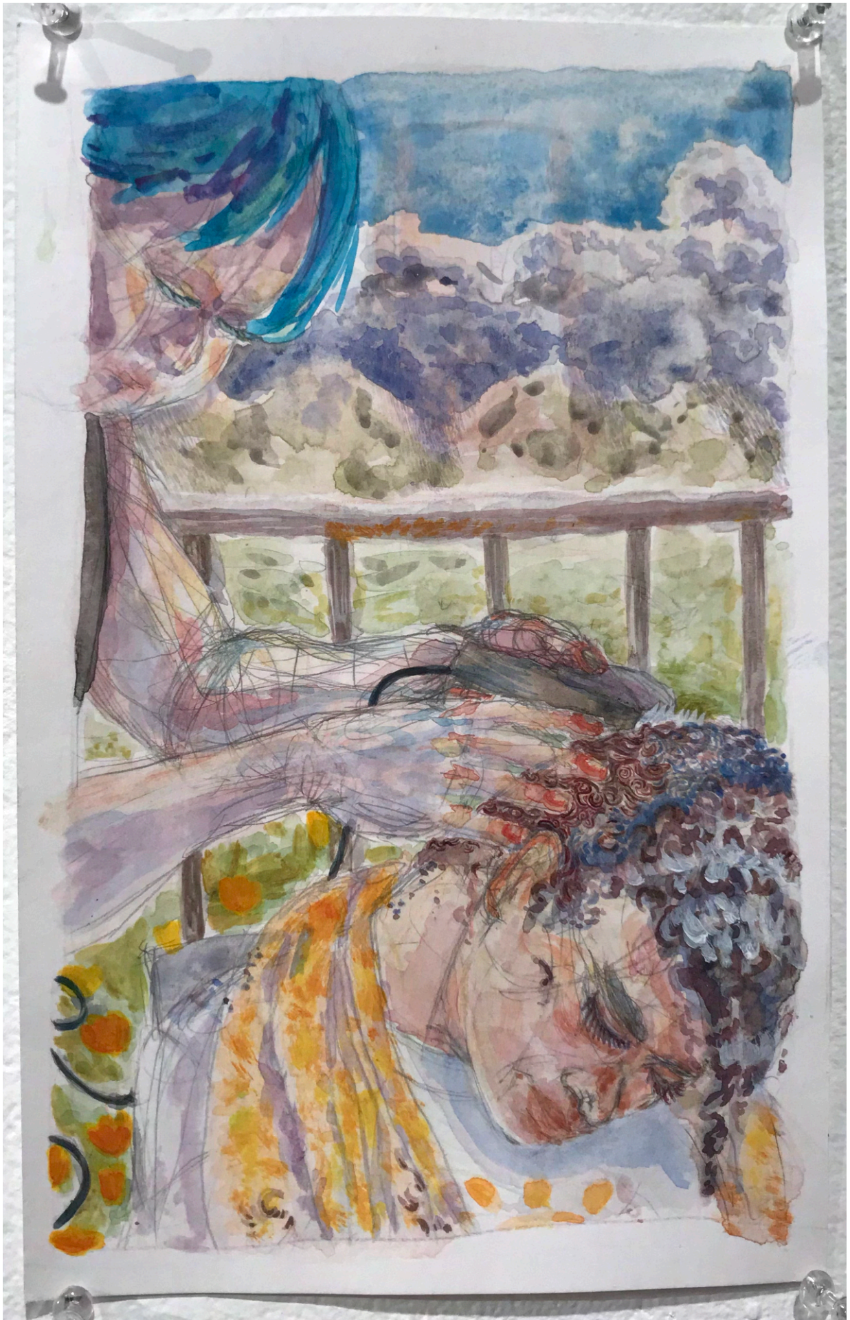
Haircut, acrylic, pencil, watercolor, 2020/21