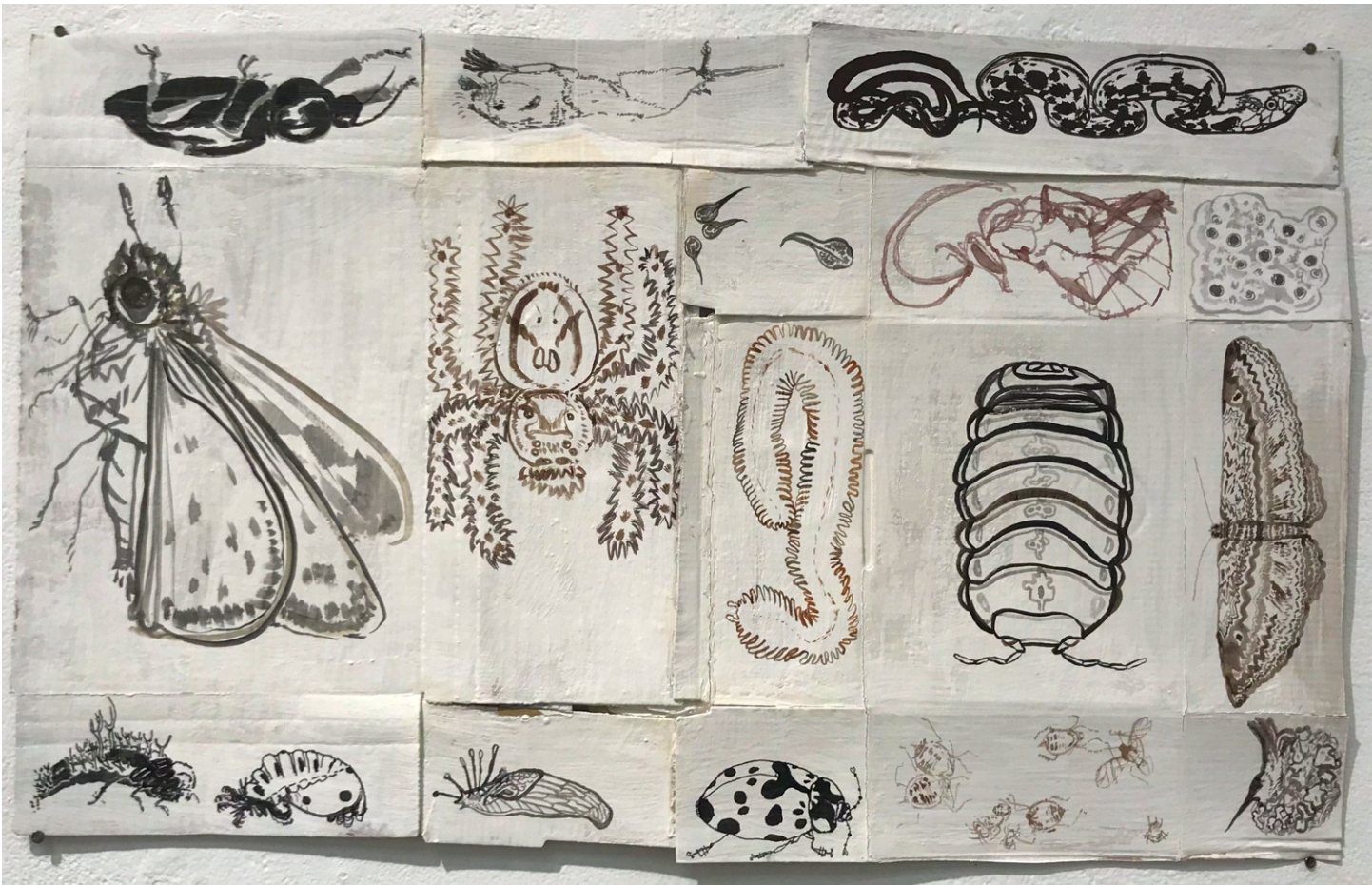
Untitled, ink, acrylic, gouache mixed, 2021